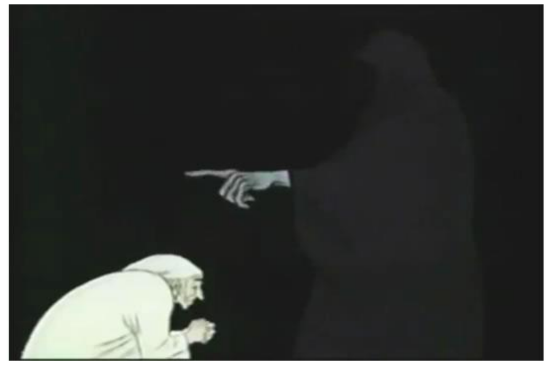
Suddenly, the ghost of Christmas future appeared. He was dark and forboding. Scrooge was very fearful of the future.